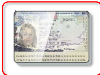
Avoid strong light reflections