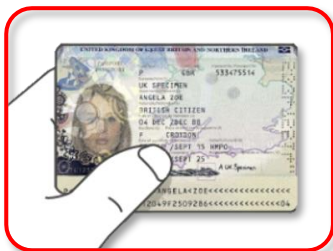
Must not be covered in any way

Documents must contain the specified document type, Specified on the worker profile (Contains the National Insurance Number) and that the image conforms with the capture guidelines as seen below.