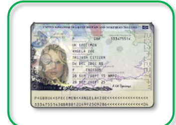
Ideal scan of the Document

Any documents presented to your site team are available to view until the point the right to work check is complete and are then hidden to all but a select few users who continue to have access of the purposes of auditing and providing evidence to authorities.